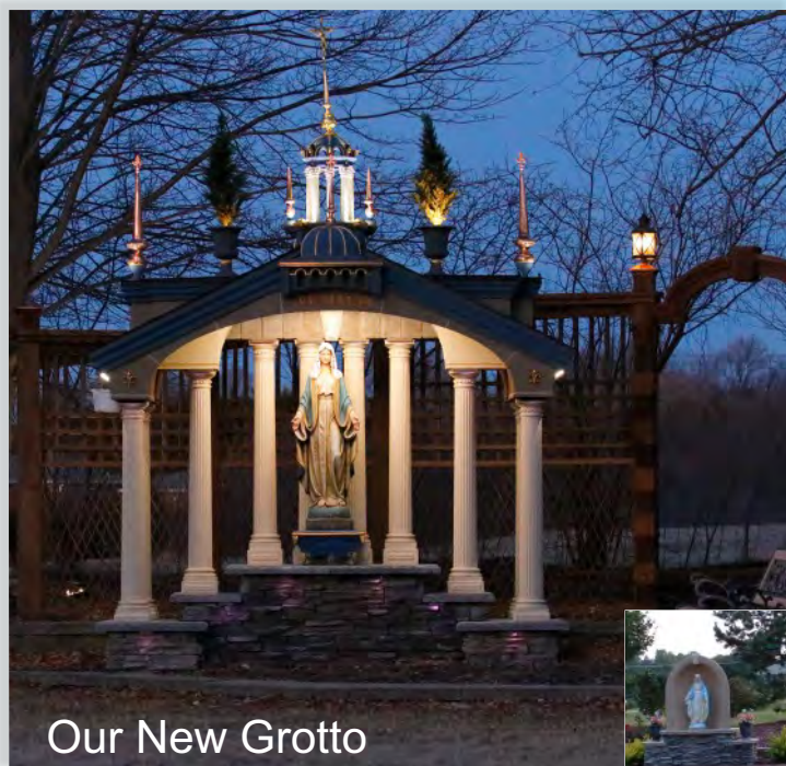
Our New Grotto

at our newly remodeled grotto on Saturday, May 6 starting at 5:00 PM