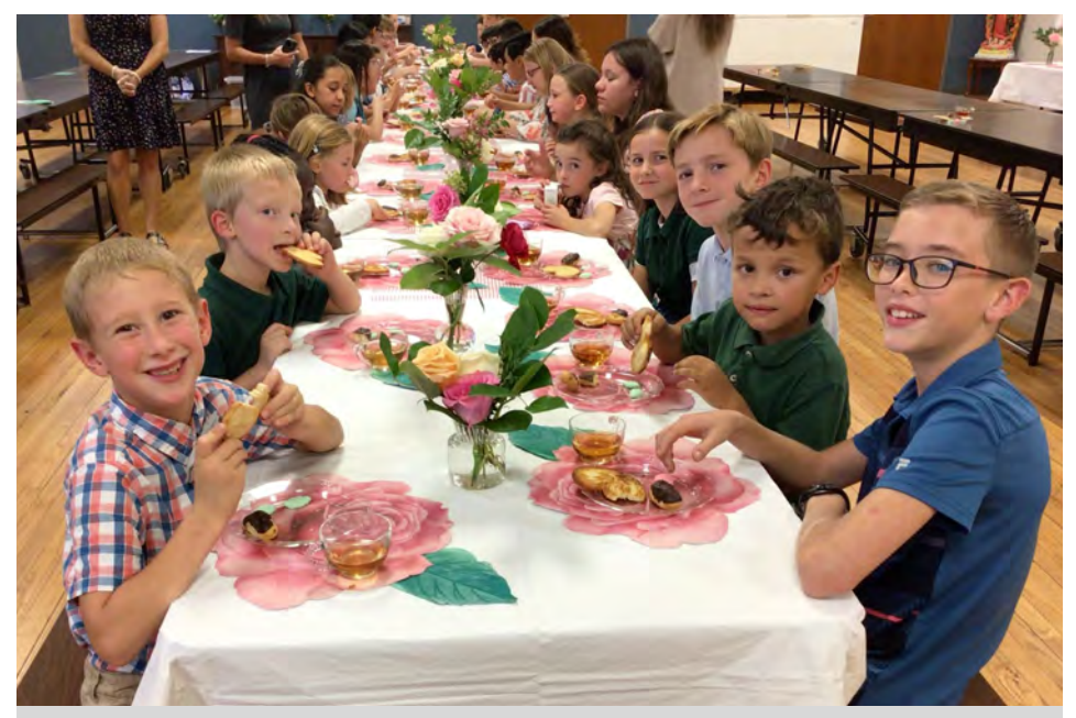
Above: In addition to celebrating the Feast of St. Therese with a Mass celebrated by Bishop Conley in the morning and a Eucharistic procession through the school in the afternoon, all students enjoyed a tea party complete with St. Therese- and rose-themed treats and decorations.